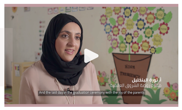
Tap to view the video

turned a personal obstacle she had to her own successful business.